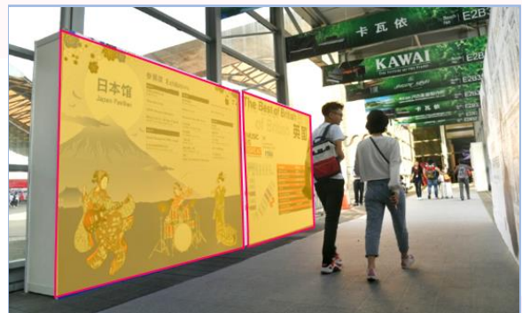
C09 Advertisement board - Corridor

Specification: 5mH x 4mW x 2-side Price: RMB 18,500 / 2-side / unit