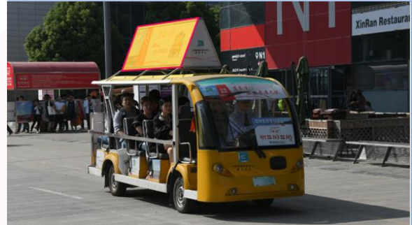
C07 Inter-hall shuttle bus advertisement

Specification: 1mH x 2mW x 4 pcs Price: RMB 27,500 / 4 pcs / station