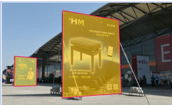
C08 Outdoor billboard - Plaza area (2-side)

Specification: 0.7mH x 2.4mW x 2-side Price: RMB 17,500 / 2-side / bus