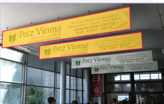
C10 Hanging banner - Corridor

Specification: 2.5mH x 3mW Price: RMB 12,000 / unit