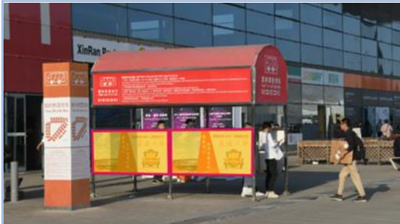
C06 Inter-hall shuttle bus station

Specification: 1mH x 2mW x 4 pcs Price: RMB 27,500 / 4 pcs / station