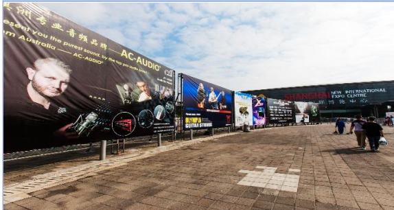
C01 Large outdoor billboard