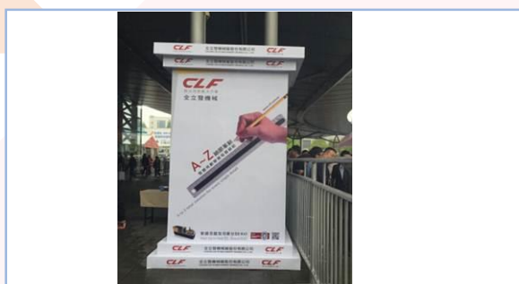
C09 Entrance square pillar advertisement

Specification: 1 m (H) x 2 m (W) x 2-side Price: RMB 27,500 / Unit