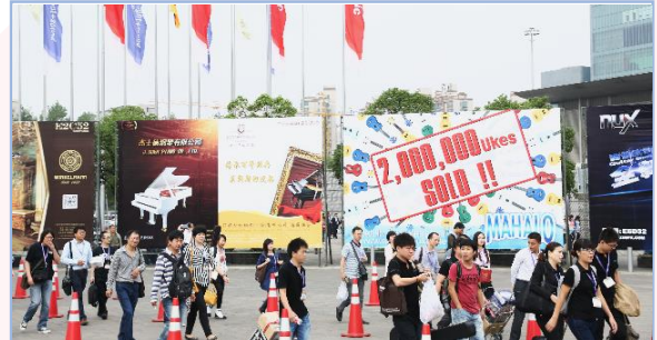
C02 Movable advertising outdoor board (Small)

Price: a) RMB 20,000 – first location b) RMB 15,000 / Unit – Non first location