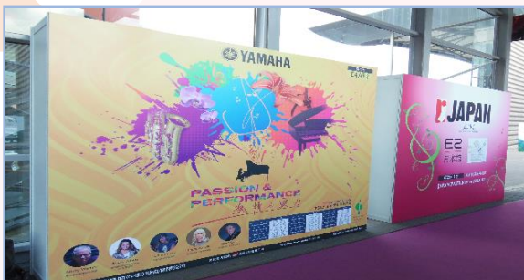
C03 Corridor advertising on the ground