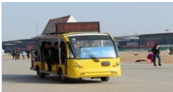
C07 Inter-hall shuttle bus advertisement

Specification: 0.7 m (H) x 2.4 m (W) Price: RMB 17,500 / Unit