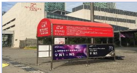
C08 Inter-hall shuttle bus station (2-side)

Specification: 0.7 m (H) x 2.4 m (W) Price: RMB 17,500 / Unit