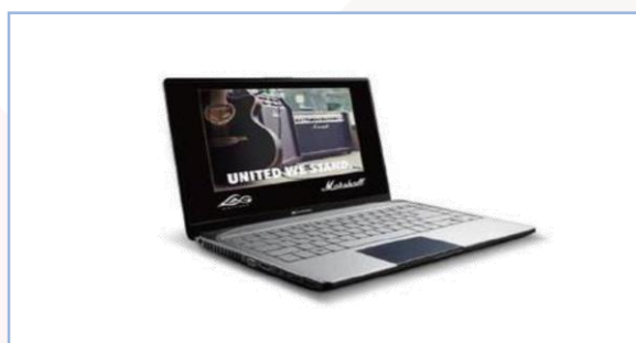
C12 Exhibition guide system ad

Specification / a) 8 m (H) x 2.2 m (W) / RMB 30,000 / Unit Price: b) 5 m (H) x 4 m (W) / RMB 40,000 / Unit