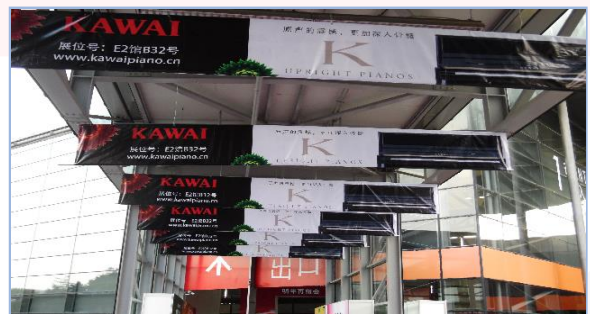
C04 Corridor advertising on the ceiling

Specification: Entrance Hall 1 to E1 Hall, Entrance Hall 3 to E7 Hall: 0.7 m (H) x 3.5 m (W);