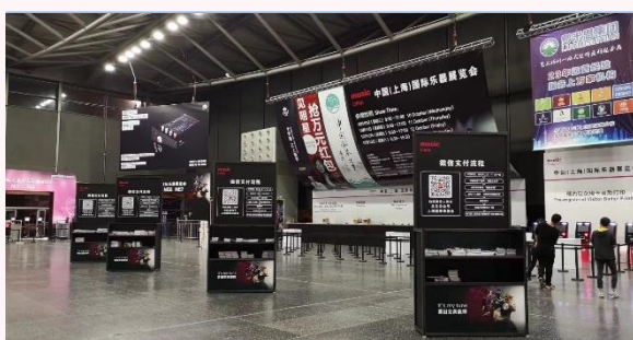
C11 Hanging banner above visitor registering counter (One side) (New)

Specification / a) 5 m (H) x 4 m (W) / RMB 60,000 / Unit Price: b) 5 m (H) x 8 m (W) / RMB 80,000 / Unit c) 5 m (H) x 16 m (W) / RMB 150,000 / Unit