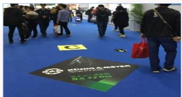
C06 Floor graphics