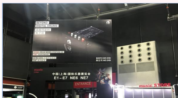
C10 Hanging banner inside visitor registering hall (One side)

Specification: 2.4 m (H) x 1.6 m (W) Price: a) RMB 150,000 (exclusive, 6 pillars) b) RMB 50,000 (4-side, 1 pillar) c) RMB 30,000 (2-side, 1 pillar)